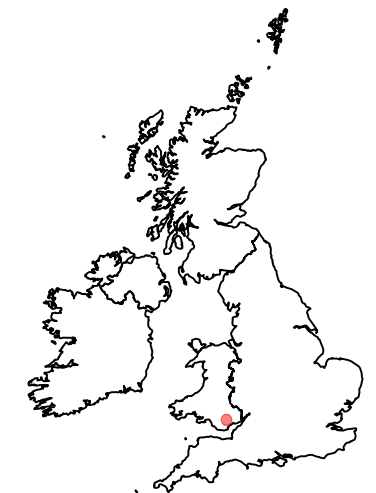
SITE LOCATION - NOT TO SCALE