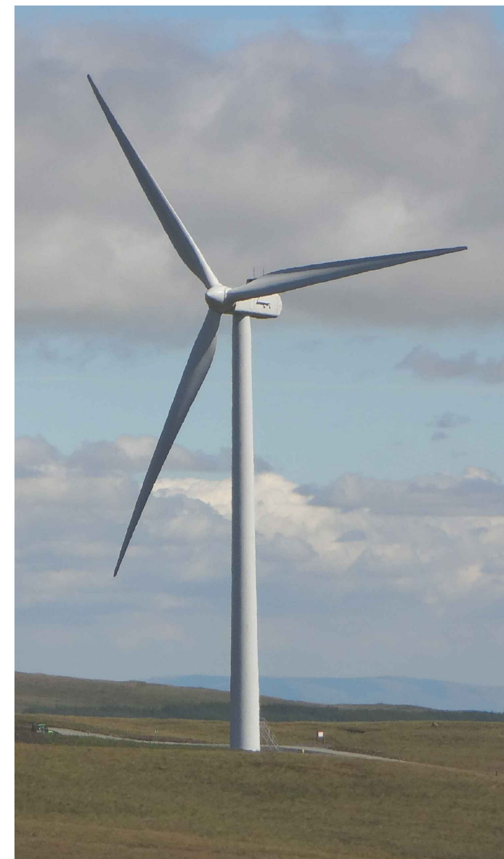
PHOTOGRAPH OF TYPICAL TURBINE